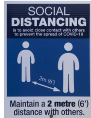
Example of Equipment: Picnic Table with Umbrella and Signage.