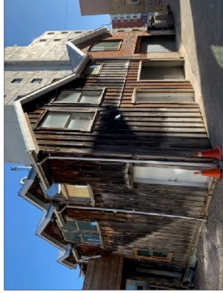
YORK LANE ELEVATION