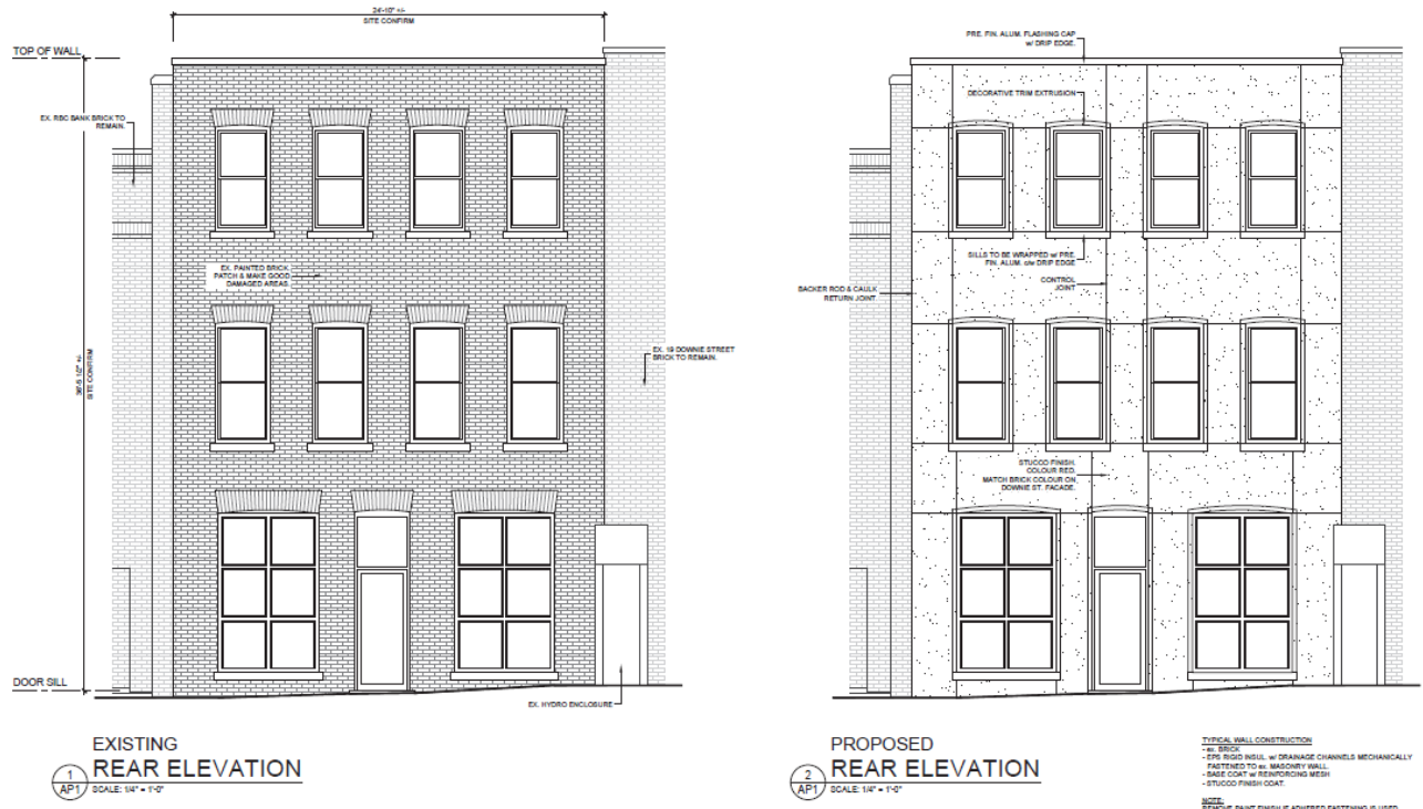
Figure 2: The existing brick façade and proposed EIFS stucco façade.

brick façade is not beyond repair, and should be repaired and maintained in accordance with provision 3.1 of the HCD Standards. As a result, the heritage alteration permit was denied.