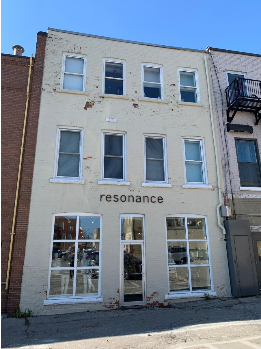
Figure 1: Site photo of the rear façade at 23 Downie Street.